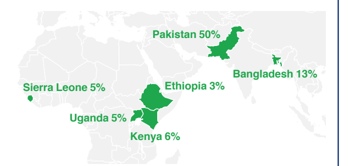
Figure 1: Coverage of overall households by main COVID-19 social assistance response

There was variation across the countries in terms of the coverage achieved by the responses, with Pakistan reaching close to half the population. Bangladesh's flagship response (the Prime Minister's cash support scheme) reached 13% of all households, while other programmes also achieved significant coverage of the population (e.g. the Gratuitous Relief programme reached over 75 million people or 45% of the population). In contrast, the flagship response programmes in Ethiopia, Kenya, Sierra Leone, and Uganda planned to reach about 3%–6% of all households through expanding coverage (new programmes) or, in the case of Ethiopia, providing additional support to existing clients.